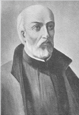
St. John de Brebeuf